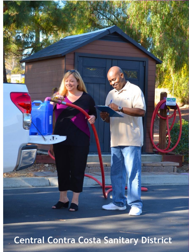
Central Contra Costa Sanitary District