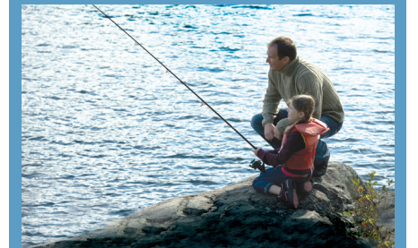
may reach the Bay