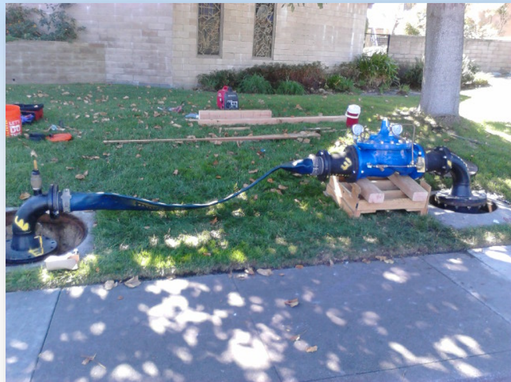
2014 Test of Davona Drive Intertie