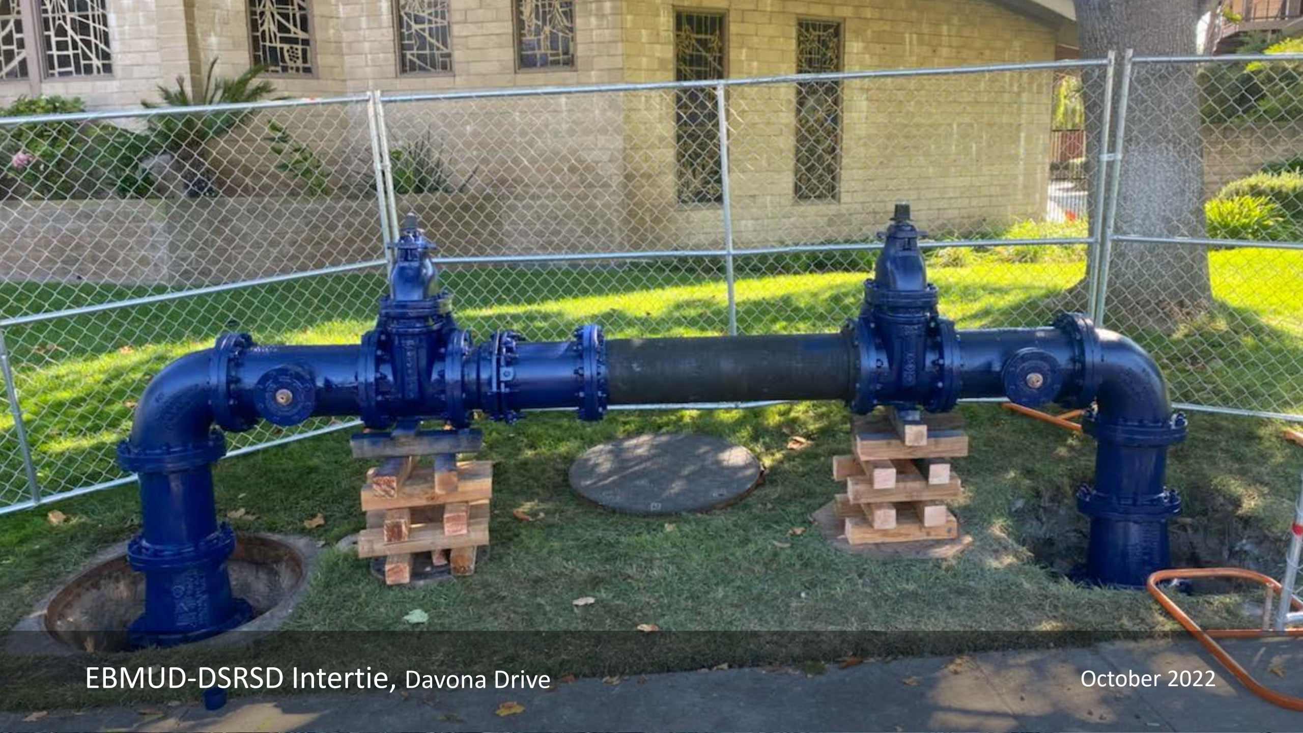
EBMUD-DSRSD Intertie, Davona Drive